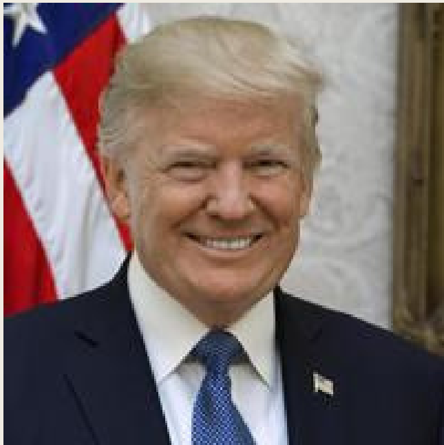
DONALD J. TRUMP REPUBLICAN