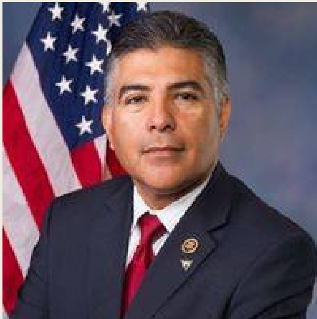
TONY CARDENAS DEMOCRAT