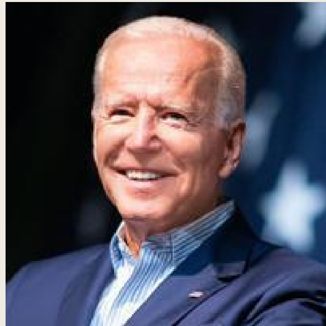
JOSEPH "JOE" BIDEN JR. DEMOCRAT